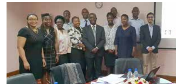
Training on Service Portfolio Development in Uganda and Tanzania in February 2019

The TISIs were trained in a range of skills, including how to analyse the specific needs of SMEs and find solutions, creating partnerships, how to facilitate participation in trade fairs and other market mechanisms, as well as monitoring their own effectiveness.