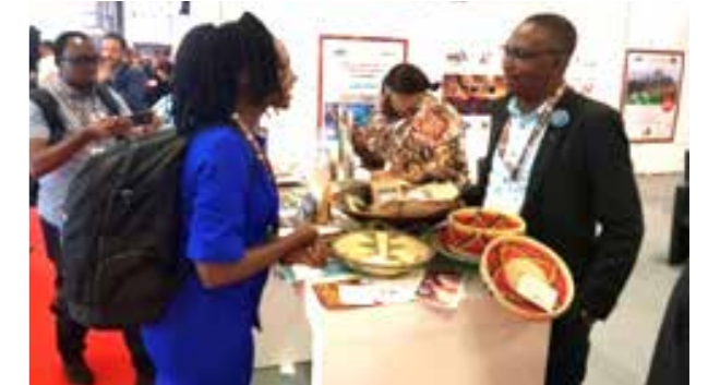
Ugandan coffee companies at the World of Coffee Fair in Berlin, June 2019

In June 2019, a total of 18 East African coffee exporters attended the two-day World of Coffee Exhibition in Berlin, Germany. Five exporters came from Rwanda, three from Burundi, four from Uganda, three from Tanzania and three from Kenya. The exporters met over 200 potential coffee buyers and roasters from the EU, Japan, Turkey, the United Arab Emirates and the United States, with strong interest shown and business leads worth US$ 5 million resulting from the exhibition.