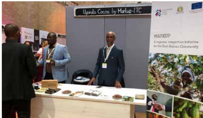
Ugandan cocoa companies at the Chocoa Trade Fair, Amsterdam, February 2019

Another company is negotiating a direct-payment contract with an interested new buyer instead of going through brokers, and one SME is exploring financing and partnership options with a foreign investor for US$ 0.5 – 2.0 million.